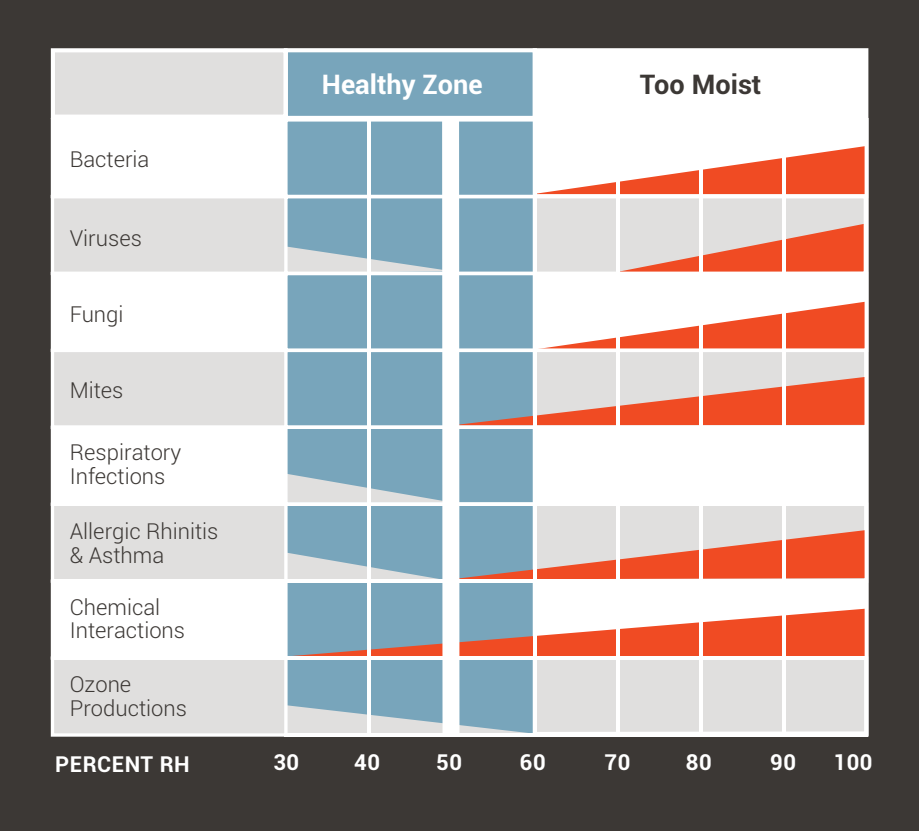
Chart data by the American Society of Heating, Refrigeration and Air Conditioning Engineers (ASHRAE).

Check out the chart to see how humidity affects your health. As the width of the bar increases, so does the likelihood of flourishing microbes and illnesses.